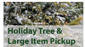
Holiday Tree & Large Item Pickup

another week the cost is $21. Call the Utility Clerk's Office at 937-859-8280 to schedule.