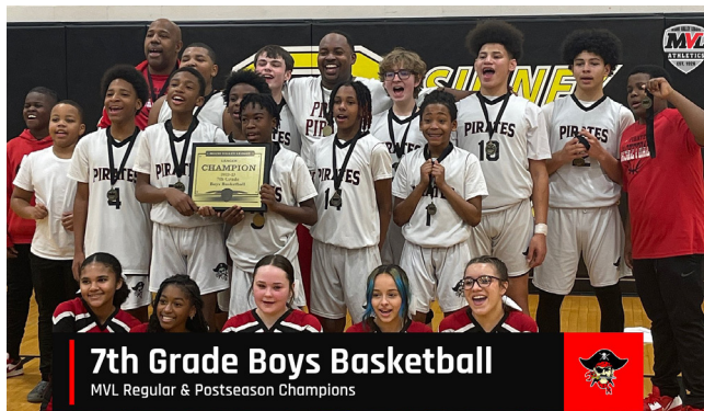
7th Grade Boys Basketball MVL Regular & Postseason Champions

Along with these highlights of achievement, the district continues to plan for the future. Phase II of the district's two part construction is currently in the planning stages. Phase II will be the construction of a building to house students in grades two through four and a campus that will house students in grades eight through twelve.