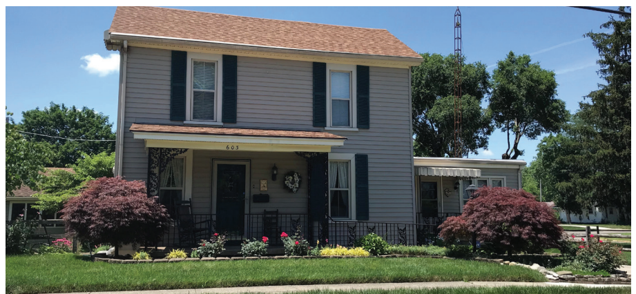
603 Burns Ave., City Beautification Winner

For more information or to report a potential violation, contact the Planning & Community Development Department at (937) 859-5783.