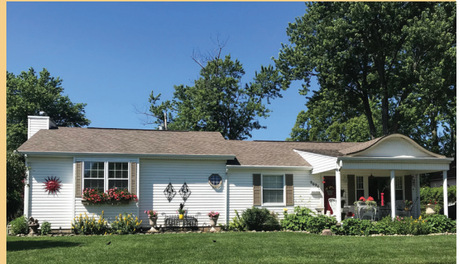
5624 Andover Ave.