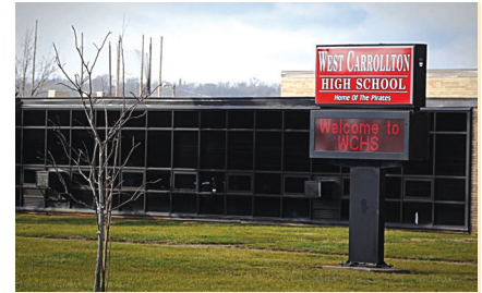
Elementary and West Carrollton High School are now located.

The plans for new construction include: a pre-kindergarten through first grade building, and a building housing grades two through four, both on the current sites of Early Childhood Center and West Carrollton Middle School; a third building for fifth- and sixth-graders - would be built at the current Holliday Elementary site. The final building for seventh-graders through seniors, in a campus with shared multi-purpose areas, would be built on land where Schnell