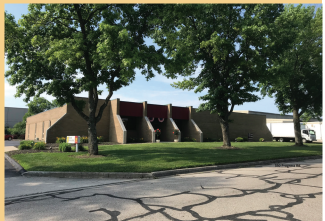
330 Progress Rd.