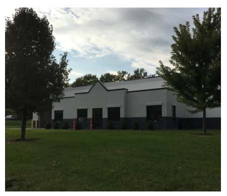
Left: At press time, renovations were underway on the Action Rubber Co. facility, located at 601 Fame Road. Right: Before renovations began on the facility.

"We prefer our location for ease of access to I-75 for shipping, centralized location for