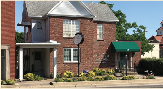
31 E. Central Ave.