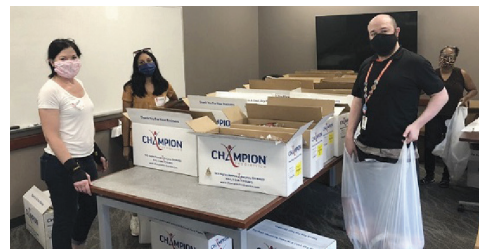
Volunteers & Staff Filling Grab-n-Go Food Bags

for each child, 0-18 years old, living in their household. Students may pick up food for themselves, but not other family members. Food distribution for Fall will be Thursdays, 4:30 – 5:30 p.m., at the West Carrollton Branch Library. For other library locations and days for the Children's Hunger Alliance food distribution program phone the Ask Me Line (937) 463 -2665.