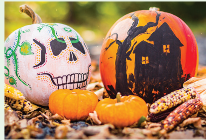
Photo Submission: Online Preferred - Reference above for submission options.