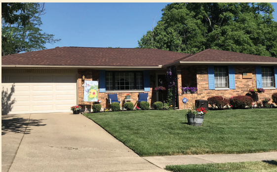
1357 Black Forest Dr.