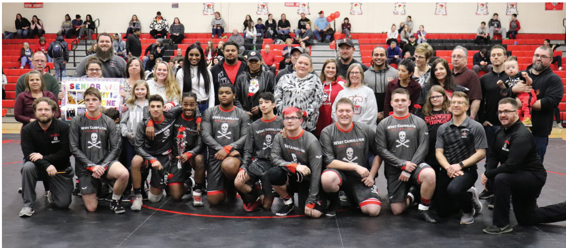
Seniors, their families, and coaches at 'Senior Night'