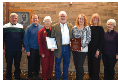
Members of Masonic Lodge #737