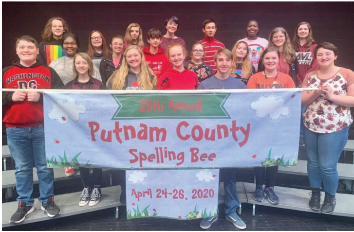
Cast & Crew for the musical.