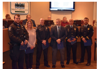
Perfect Attendance Award Winners